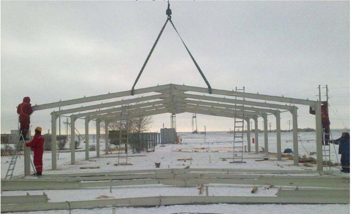
Aktua Kazakhstan 2012

We have also Great Referances to show as not only being a prefab camp builder; As a Steel Structural Manufacturer