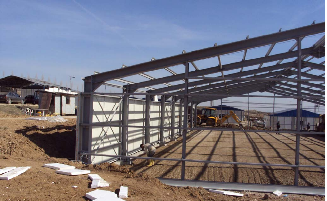
New Housing Project Planning Center-Ankara

Some Referances has to be given from MNG Construction too as Building up Baku-Nahcivan Passenger Terminal