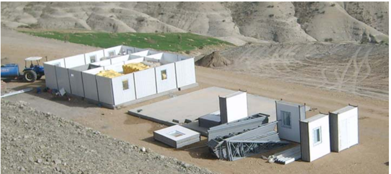
A daily view on Mounting