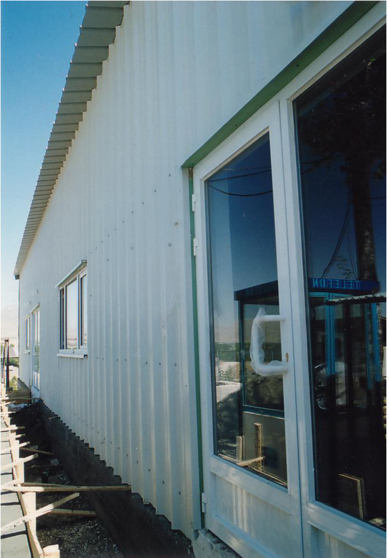
Main Military Activities Center with Two Halls, City of Van near Van Lake, Turkey