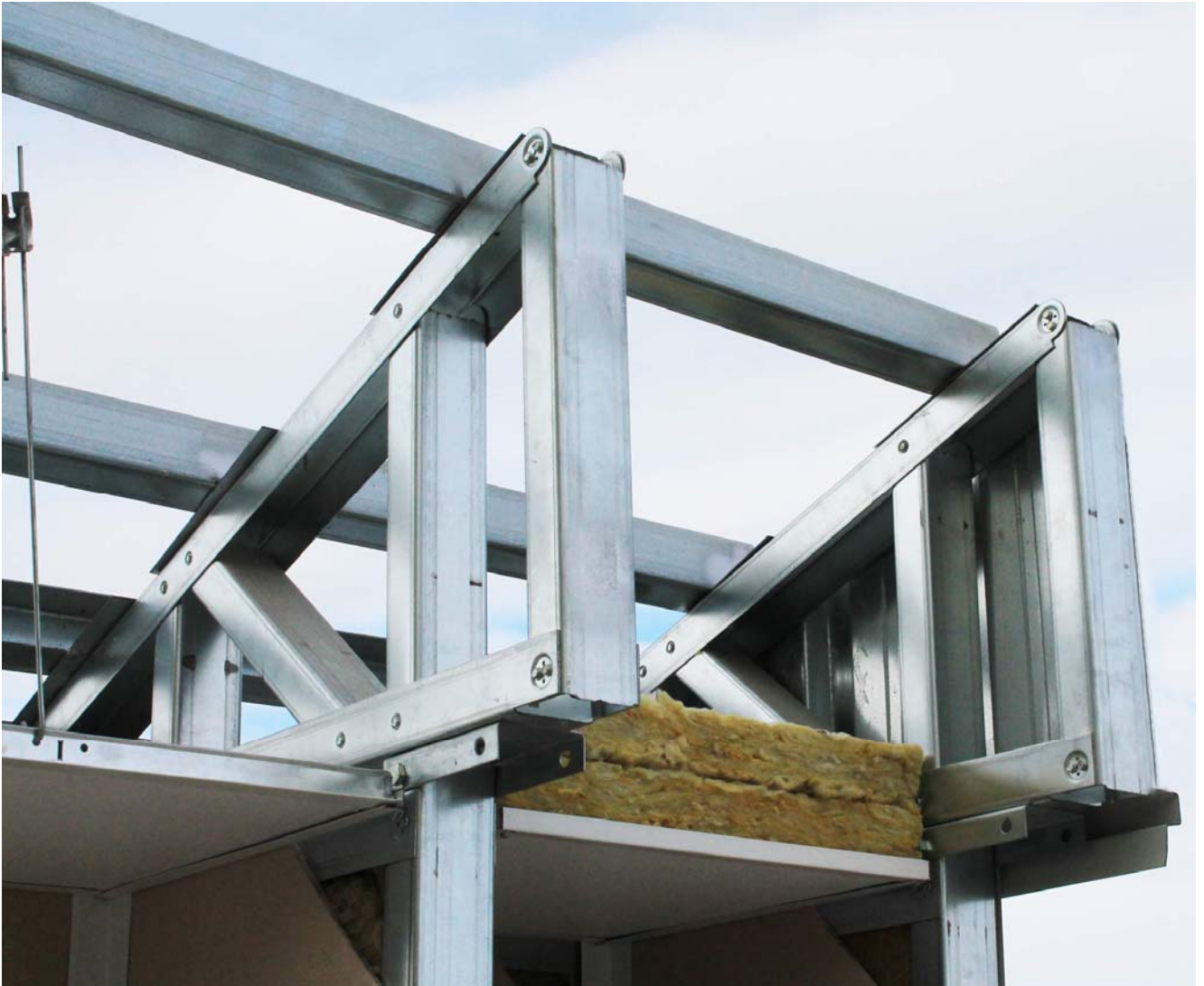
System Details ( Galvanized and Automatic Production Details)