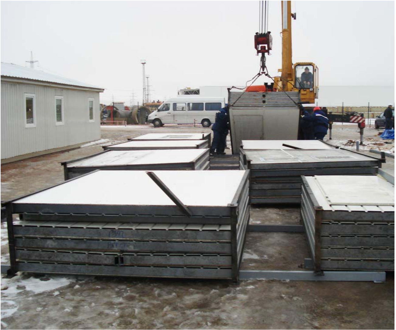
How to start