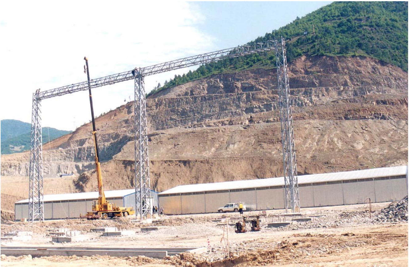
Konya GES Energys Projects