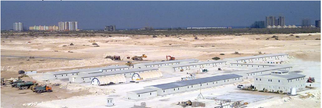
Over 2.500.000 USD job has been finished in Kish Island Project in Iran