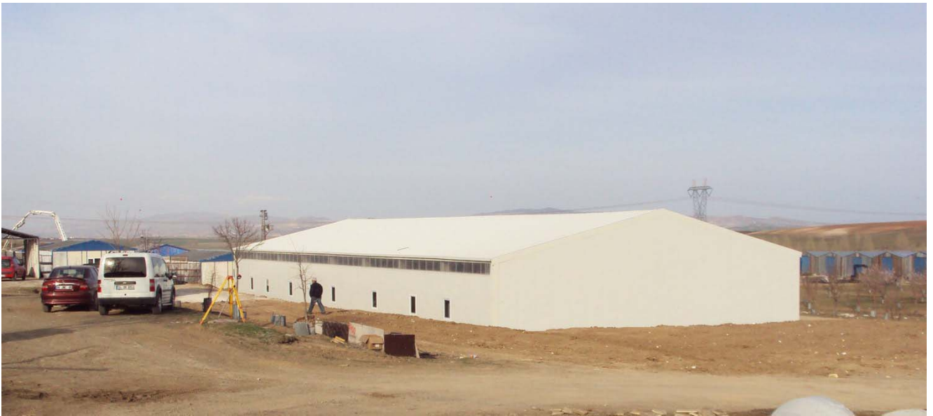
After 10 days of Heavy Working New Housing Project Planning Center has been Turn-Key delivered up-Ankara